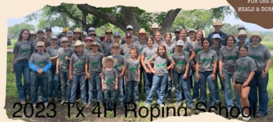
2023 Tx 4H Roping School

$600 INCLUDES SCHOOL, GROUP INSURANCE, STALL RENT FOR ONE HORSE, MEALS & DORM LODGING